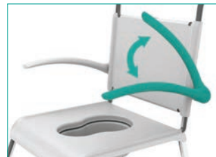
Hinged, lockable arms for easy patient transfer.