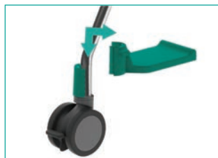
Patent-pending clip and slide footrests.