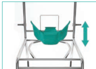
Top loading, moulded, single-piece, plastic bedpan rack.