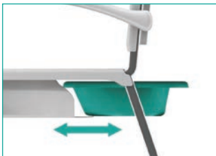
Plastic or pulp bedpans slide in from the rear.