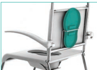
Seat cover stows safely at the back of the seat.